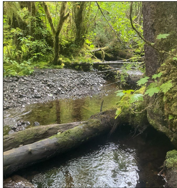
Figure 3.—Looking downstream at waypoint 1170.