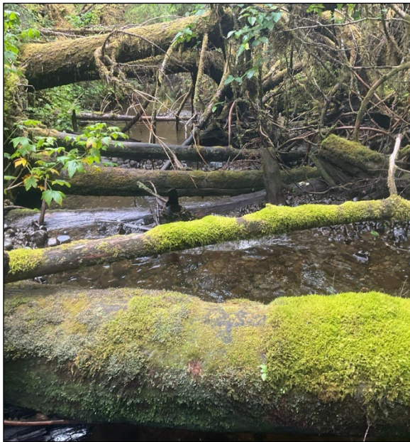
Figure 2.—Looking downstream at waypoint 1179.