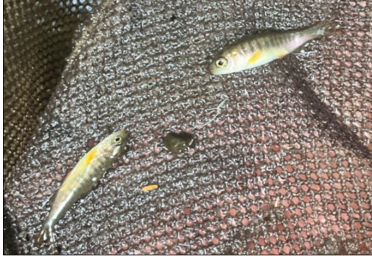
Figure 1.—Juvenile coho salmon caught at waypoint 1179.